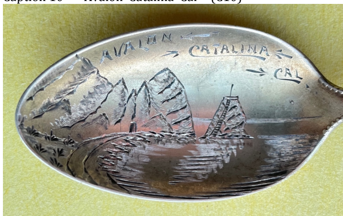
on Gorham Lancaster pattern (1897)